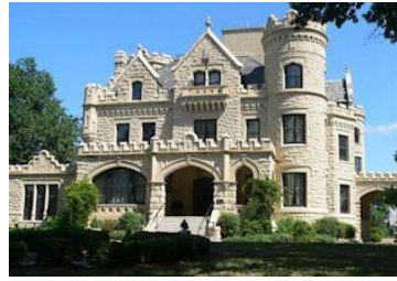
The Joslyn Castle