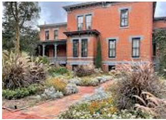
Joslyn Art Museum, has just been added on to. $$$$$