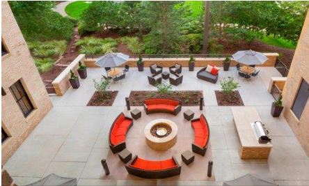
Outdoor area with grill & fire pit.

Our excursions will be done in these trollies. Depending on the number of attendees will determine the size and number of Trollies. We will have tour guides that are very educated and professional in the sights and sounds we will be passing. We will have beverages and snacks on the trolley. We will hear and see the history of Omaha, where the gates to the west started, captains of industry started and many MVP's of the nation visited. Where the Mormons stayed and the American Indian and railroad made history. Check out the hotel at: https://www.marriott.com/en-us/hotels/omart-residence-inn-omaha-downtown-old-market-area/photos/