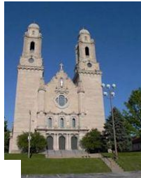
St. Cecilia Cathedral